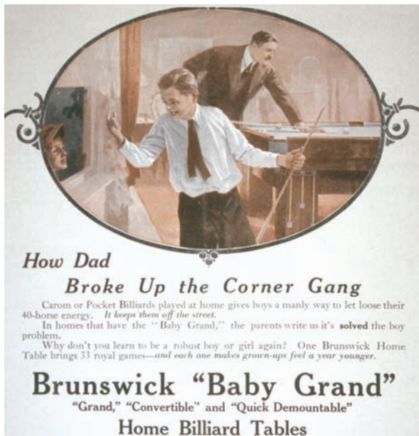
The Brunswick brand cultivated a family-friendly image.