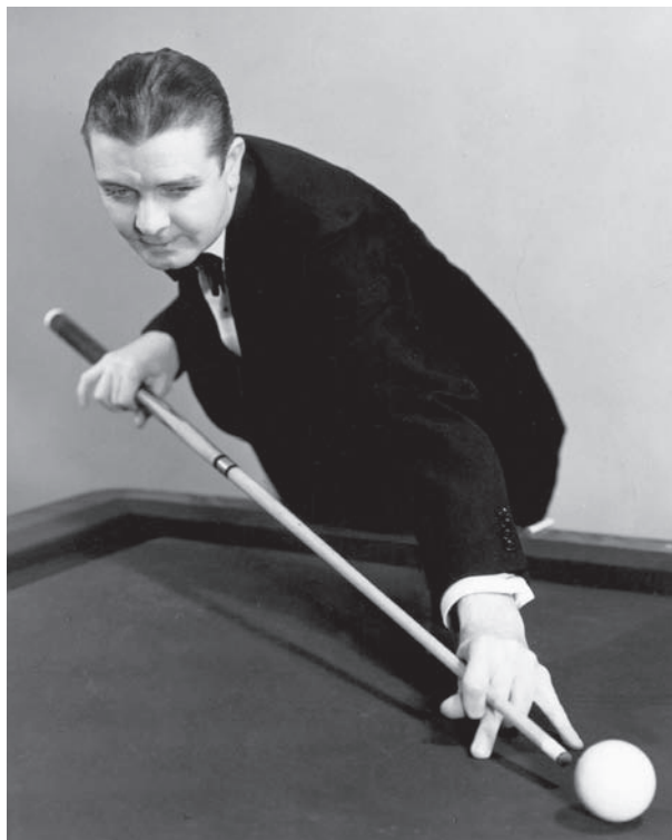
Barred from the world tournament, Greenleaf struck back.

not the company, that barred Greenleaf. Brunswick further alleged that Greenleaf was barred from the tournament not for any improper monopolistic reasons, but because the former champion had acted deplorably during previous matches.